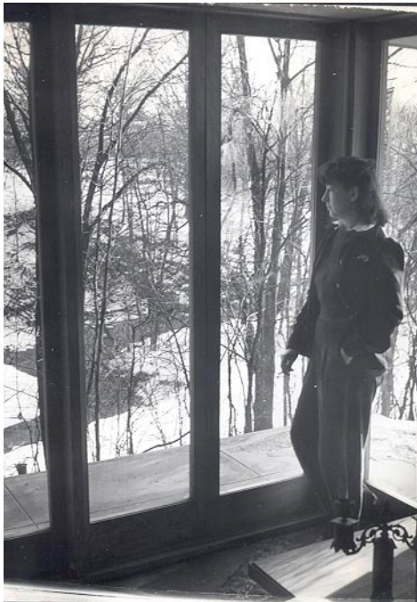
Main House interior