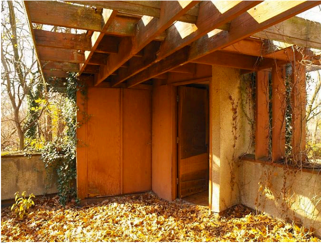
Tower rooftop trellis and outdoor Murphy bed

is a humble exploration of this human exchange with nature, of the idea that the individual's experience with nature can be transcendent. Even in its advanced state of disrepair, the endangered Gunning House stands as a reminder that the built environment can promote that transcendence.