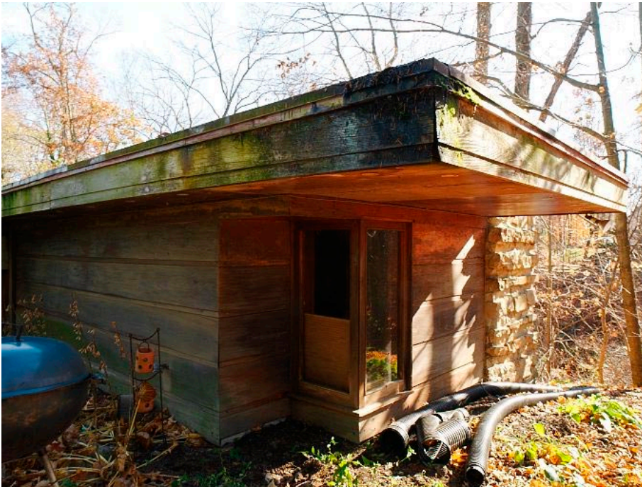
Main House