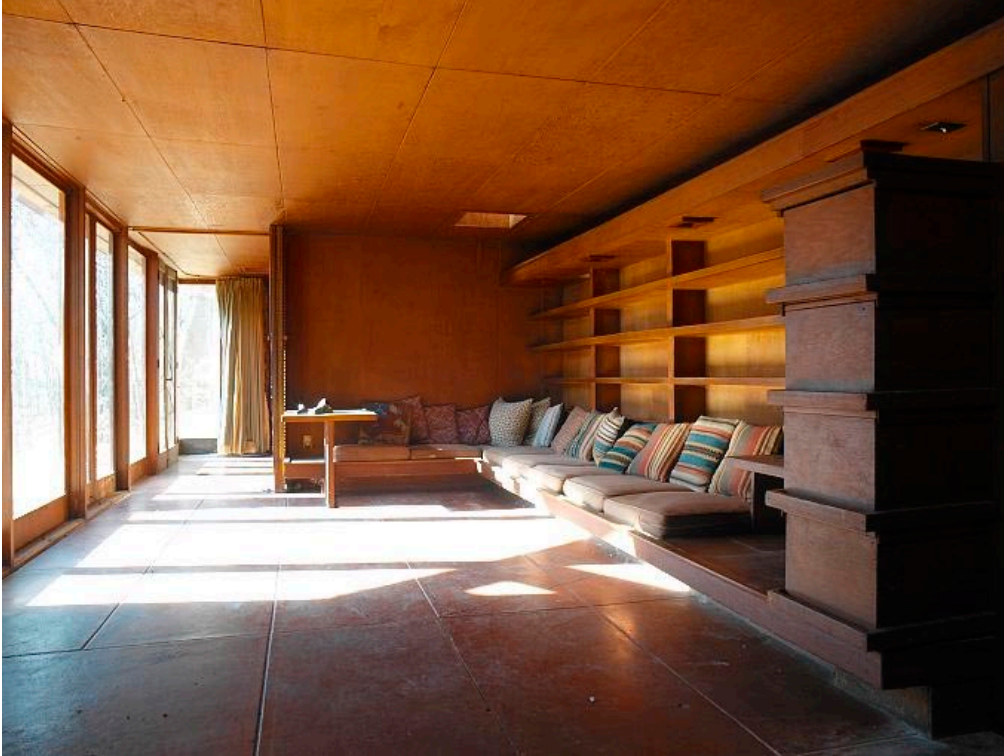
Main House interior