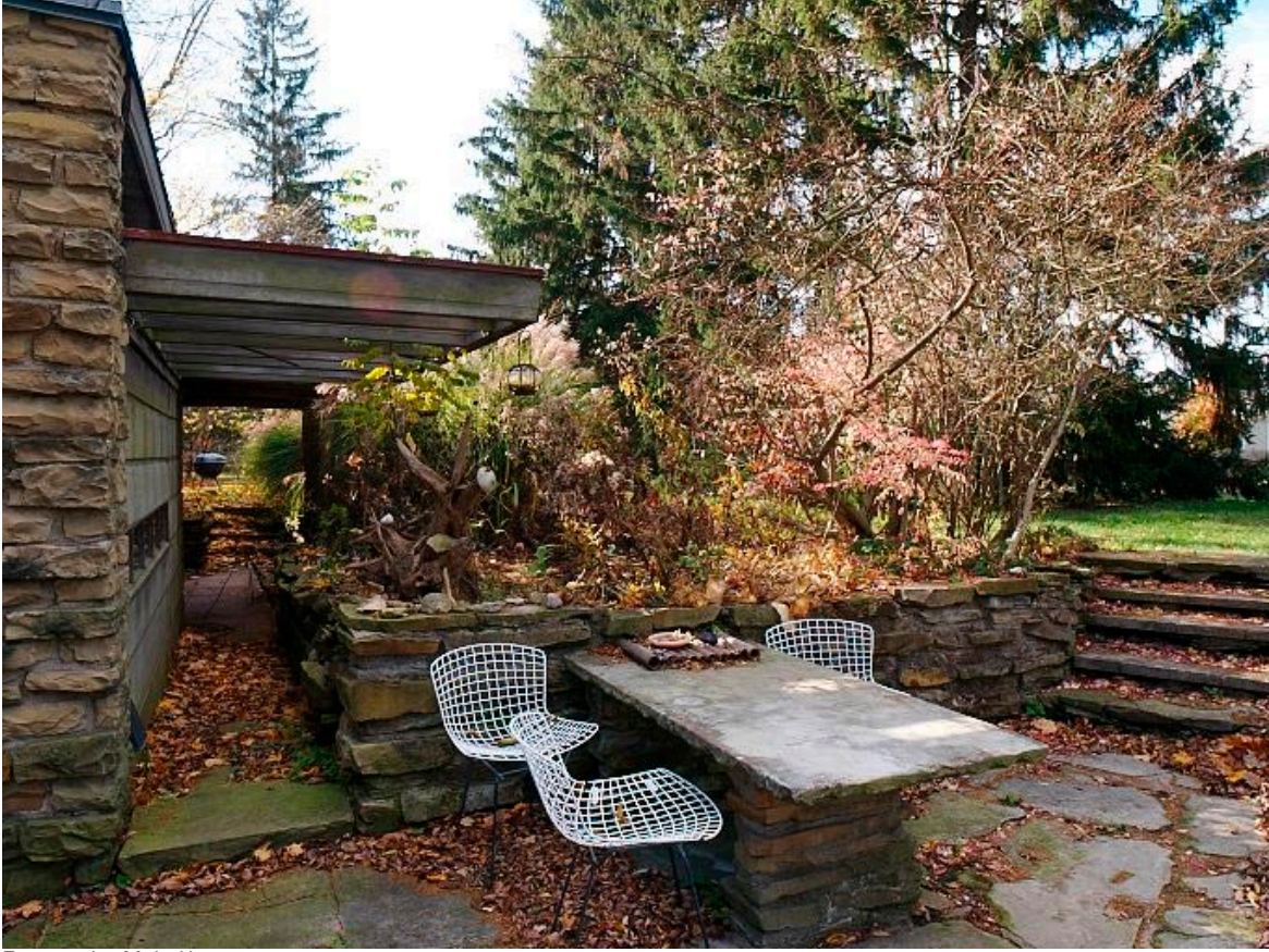
Entry patio, Main House